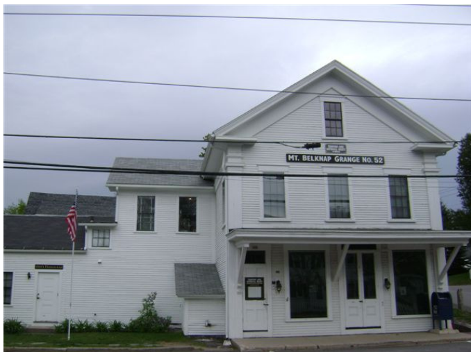
The Gilford Grange as it stands today.