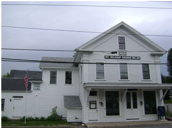
The Gilford Grange as it stands today.